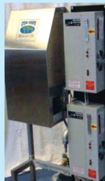
Front View Oxygen Concentrator and Ozone Generators