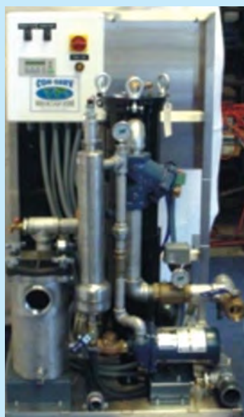
Back View Inlets and Outlets

* GPM Ratings may vary due to Piping Layout that may change Pump Head Curve